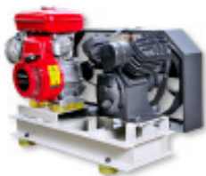
Engine driven compressor