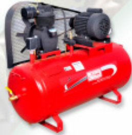
Beat - 10ES