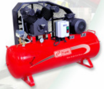
Beat - 30S to 75S