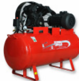
Beat - 20ES to 50ES