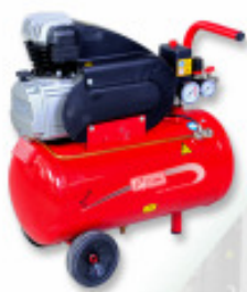
Beat - 10D to 20D

Piston : Equalized and balanced pistons are made from aluminium material. Each piston has compression rings and oil control rings for optimum efficiency.